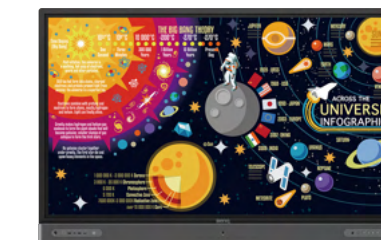
RP Series Interactive Display