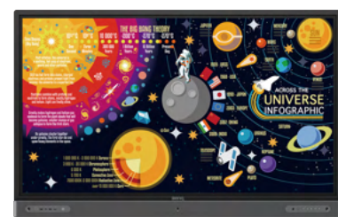
RP Series Interactive Display

Higher education classes can often have a blend of both in-class and remote students. BenQ's line of education products makes it easy for everyone in hybrid classrooms to be immersed in lessons and participate actively. All BenQ interactive displays come equipped with ClassroomCare™ features, including germ-resistant screens, to promote a healthy learning environment.