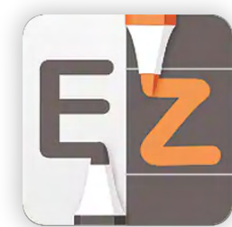
EZWrite Interactive Whiteboard