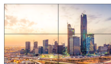
PL Series Video Wall

Deliver an immersive viewing experience in auditoriums of any size. Scalable video walls ensure that the content played is clearly seen from anywhere in the room, whether it's for large-group lessons or special presentations. With wireless screen sharing through InstaShare 2, students can actively participate in sessions without leaving their seats.