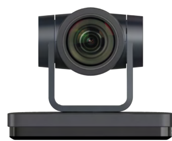
DVY Series 20x Zoom Conference Camera