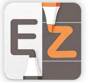
EZWrite Interactive Whiteboard