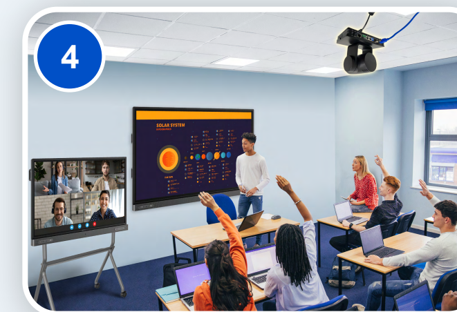
Higher education classroom

Scalable video walls deliver immersive viewing experiences in auditoriums of any size for large-group lessons or special presentations.