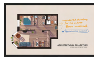
CP Series Interactive Display