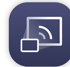
InstaShare 2 Wireless Screen Sharing