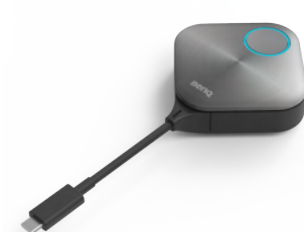
InstaShare Button Wireless Presentation