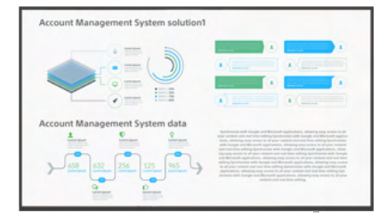
ST Series 4K Smart Display