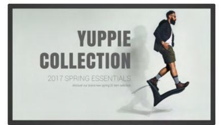
IL Series Interactive Signage