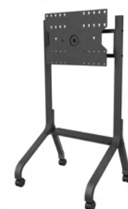
Mobile Stand with Rotating Mount