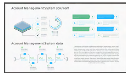
ST Series 4K Smart Display