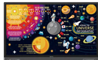
RP Series Interactive Display