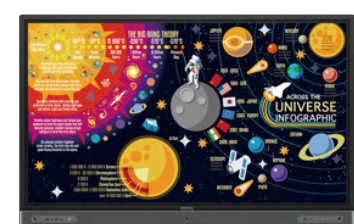
RP Series Interactive Display

Science experiments don't have to be the only hands-on activity in the lab. Interactive displays open up a world of endless possibilities for more interesting lessons and experiments. Using wireless screen sharing and real-time annotation on a BenQ display with InstaShare 2, students can explore formulas and formulate hypotheses from anywhere in the room.