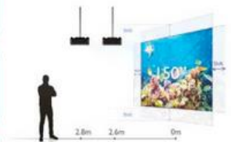
Ultra Short-Throw design for unobstructed viewing without space constraints

BenQ BlueCore laser projectors are IP5X certified, guaranteeing a hassle-free, long-life experience.